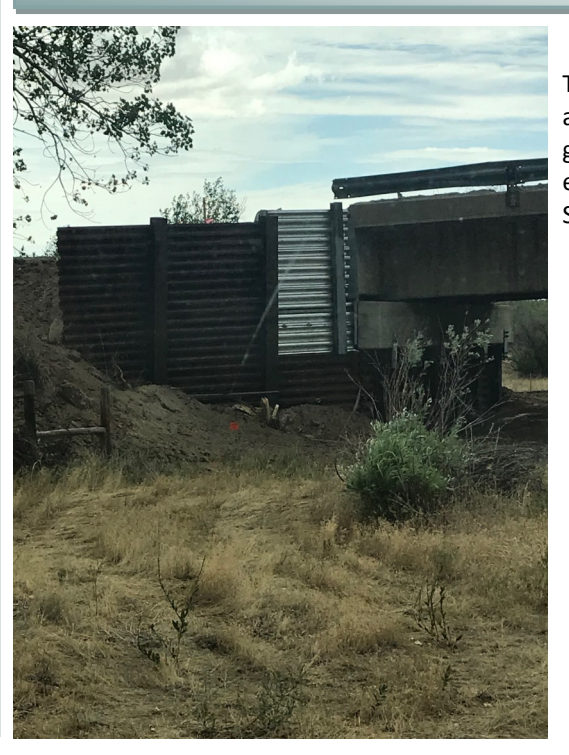
Photo and Update by Wayne Harris The bridge abutments have been fixed and approaches at both end of bridge have been graded. They will asphalt 50' to 100' on each end of the bridge. Heavy work is completed. Stay tuned and check crci.org for updates.