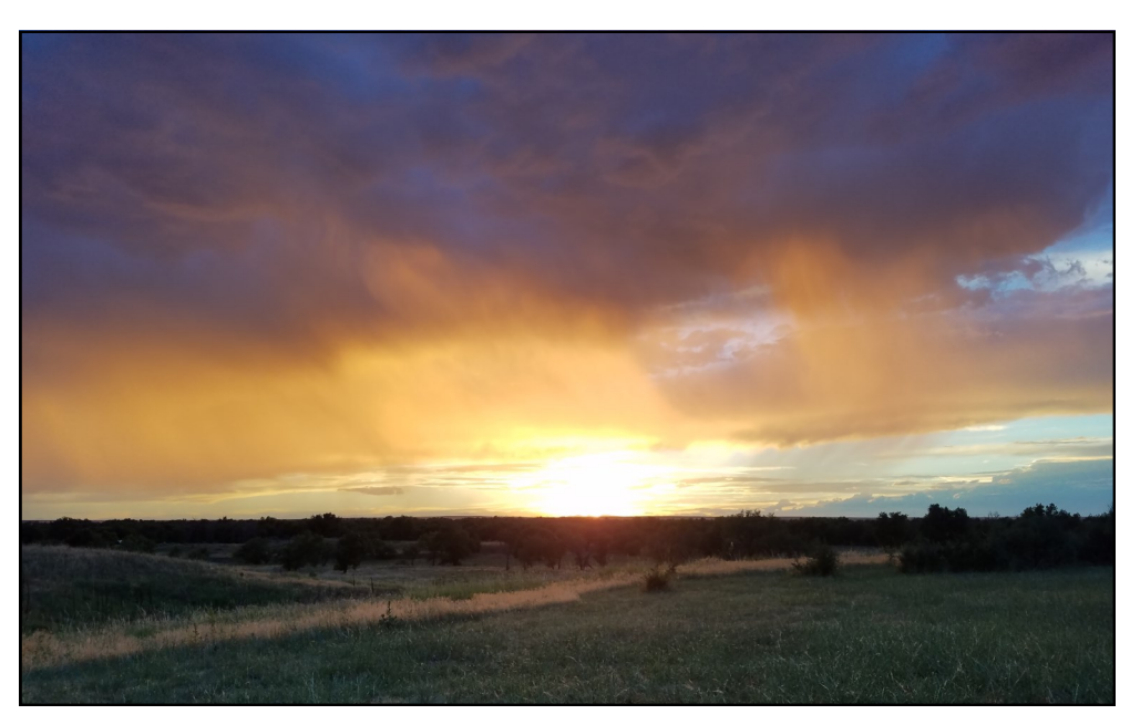
Sunset at the Farm House, July 23, 2016

July 16, 2016 NRA Pistol Results: <u>Camp Perry Consolation Match</u> <u>July 16, 2016 Colorado Rifle Club Garand Rifle Military Match Results</u> <u>July 23-24, 2016 Redfield Metric Smallbore Prone</u> <u>July 24, 2016 IHMSA Pistol Silhouette Match Results</u>