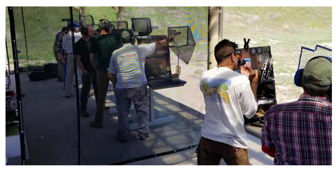
View from the match director stand.

Held June 1 and 2, 2019.