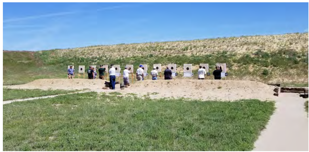
Scoring at the 50 yard line.