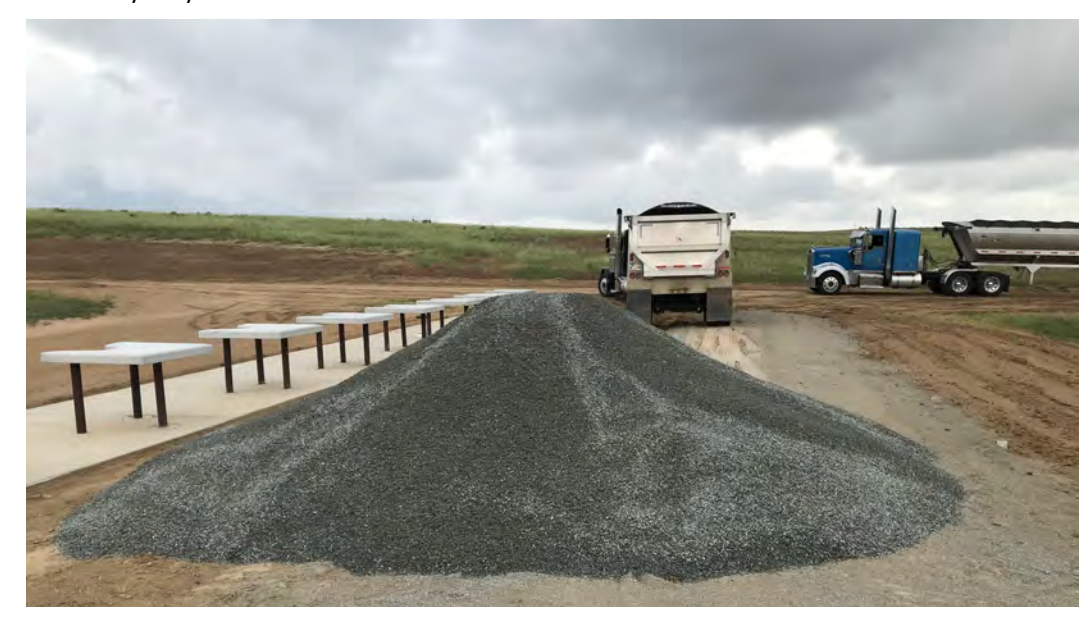
Gravel at the high power range.