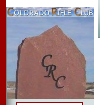
July 10, 2019