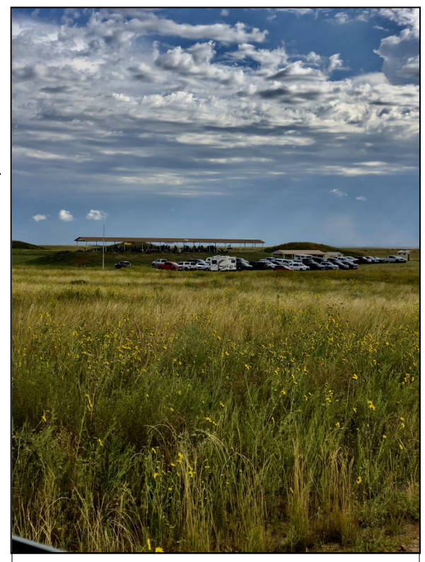
The high power range during the F-Class Higher Power Long Range event on August 24.

If you have any other ideas for Engle Scout projects, please email them to me.