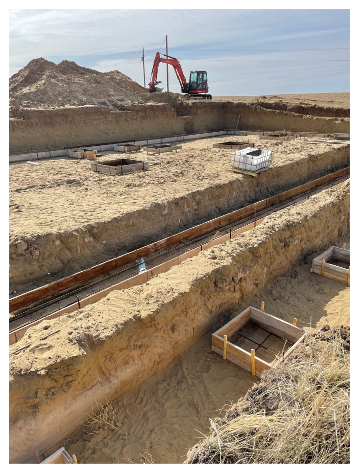
Clubhouse foundation