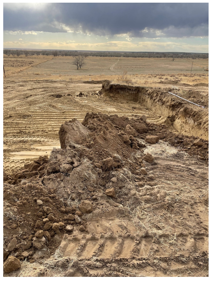
Early earthwork - Photo by Wayne Harris