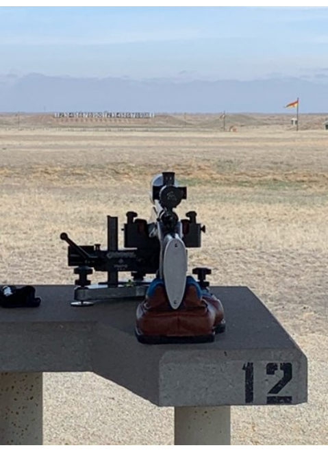
It's a fair piece down there to that target!