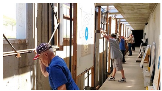
Running the pits!

"All hail" to the gentlemen who designed this facility and to the CRC Administration who had the foresight to build it. Our pits are among the best in the nation!