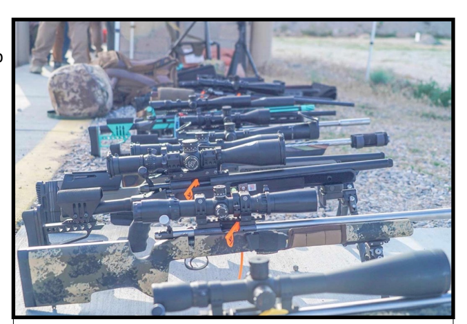
A sampling of Precision Rimfire riles and optics.

Lastly, there is an <u>in-depth description of the match on the CRC</u> <u>website</u>, including the Course of Fire, a more detailed list of equipment requirements, and important signup information.