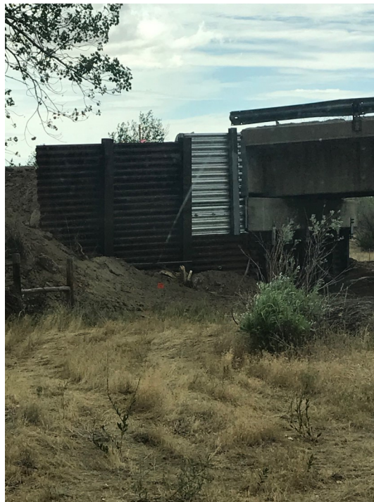
The bridge abutments have been fixed and approaches at both end of bridge have been graded. They will asphalt 50' to 100' on each end of the bridge. Heavy work is completed. Stay tuned and check crci.org for updates.

Get all the news and photos at http://crci.org/