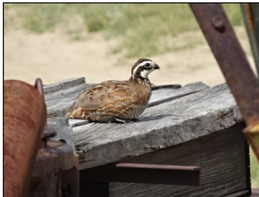
Latest crop of quail at CRC