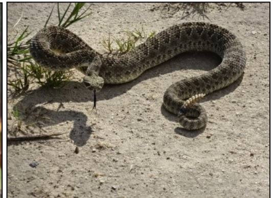
Watch for rattlesnakes but do not kill bull snakes