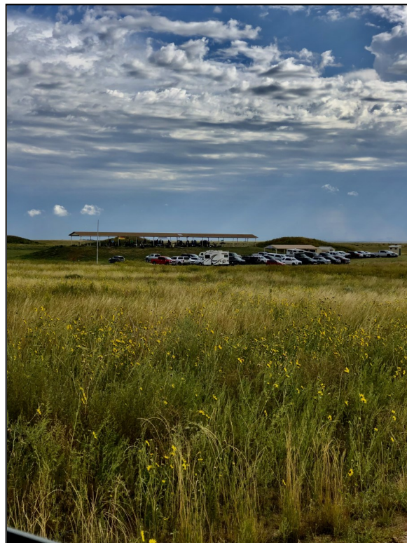
The high power range during the F-Class Higher Power Long Range event on August 24.

If you have any other ideas for Engle Scout projects, please email them to me.