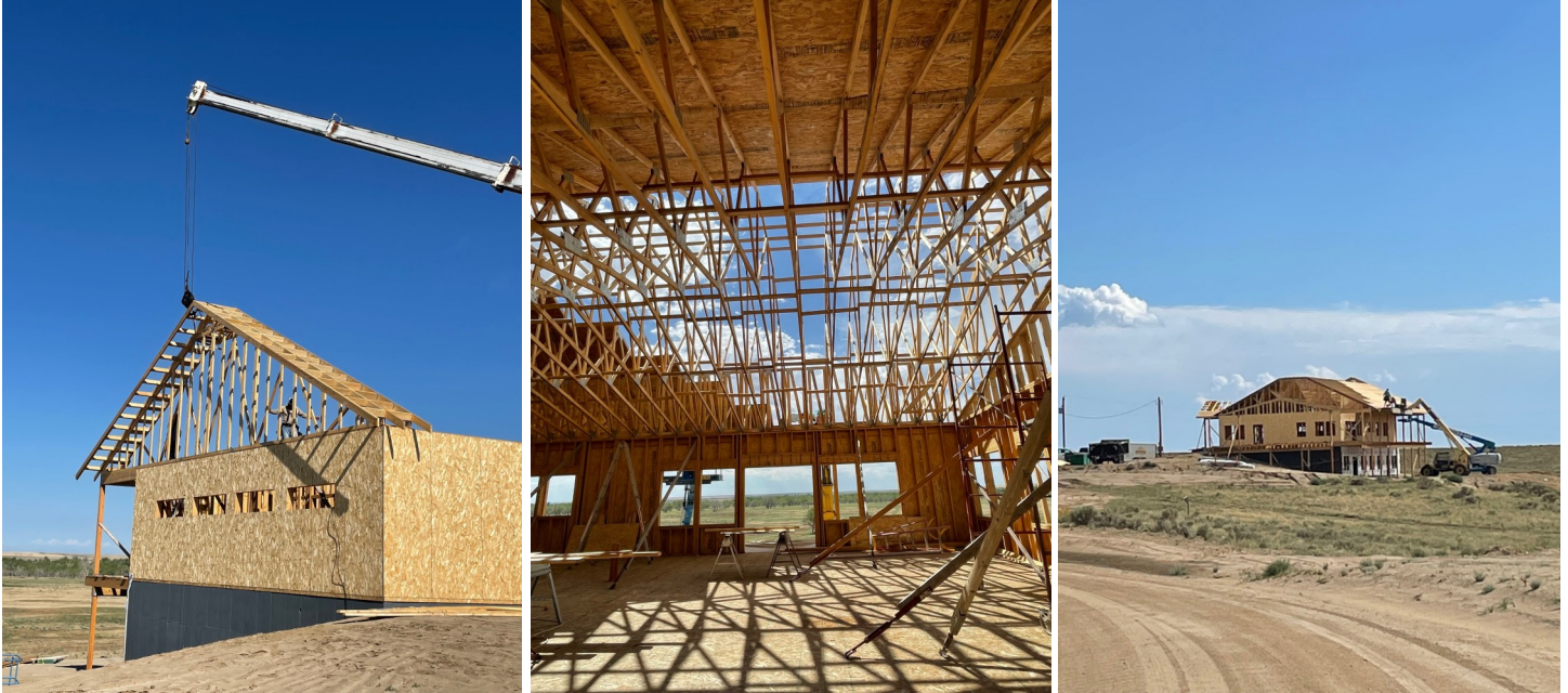
Above: Clubhouse trusses and roof sheathing

Below Left: Another view of the water main installation Below center: Grading next to the clubhouse Below right: Fill on the Smallbore Range