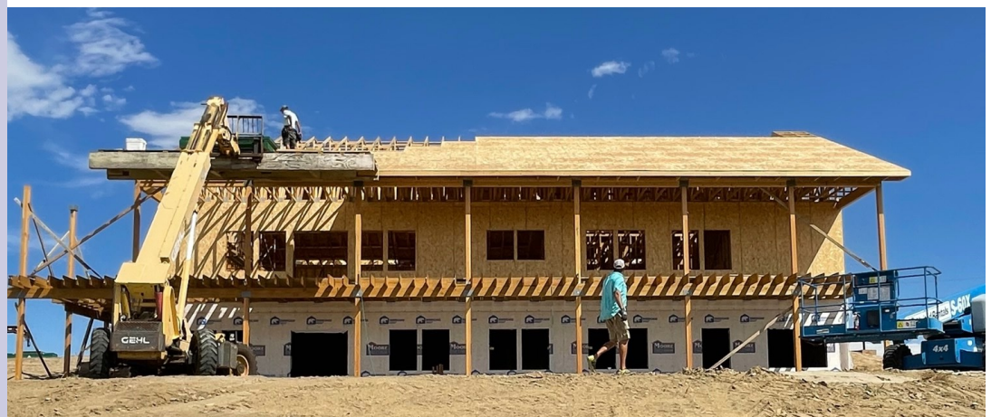
Installing the roof sheeting

The GC plans on finishing the roof trusses and sheeting over the North deck the first week of September and then he will install the interior stairs. About this same time he will start installation of all exterior doors and windows with the goal of having the building enclosed by the end of September. When the structure is enclosed the other trades such as electrical, HVAC, plumbing, security and piping will move in to complete their preliminary installation work. The finish work such as drywall and flooring will commence in November. The Final Certificate of Occupancy should be obtained in January or February. One item which might slow our GC down for a day or two is the expected arrival of his fifth child in mid-September. We are making progress.