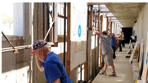
Running the pits!

"All hail" to the gentlemen who designed this facility and to the CRC Administration who had the foresight to build it. Our pits are among the best in the nation!