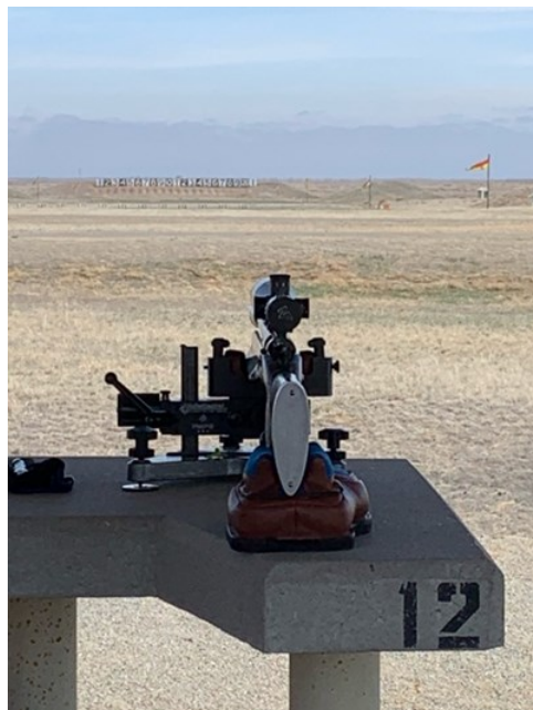
It's a fair piece down there to that target!