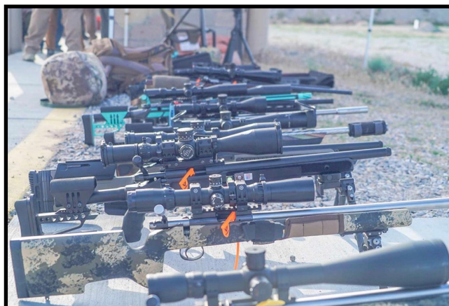
A sampling of Precision Rimfire rifles and optics.

Lastly, there is an in-depth description of the match on the CRC website , including the Course of Fire, a more detailed list of equipment requirements, and important signup information.