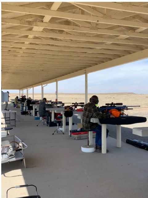
Calling the line on relay one.